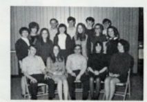
Jr. - Sr. High Religion Class