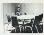
Confirmation Class in Hall